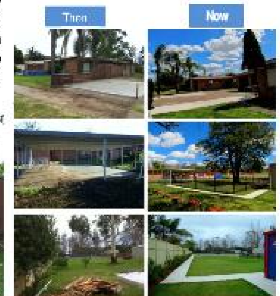
A Glimpse of the past

The first achievement of the year was the registration of the school for five years until December 2017. The senior official of the Board of Studies encouraged us with the registration of Year 5 and 6. In addition they quoted, "If we compare the beginning of your school with others, you are miles ahead of them". This was with the help of Allah (SWT), our hard work and outstanding presentation. WGS stood above the national average level in the NAPLAN 2012: