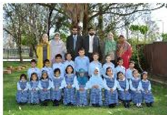
A School in its Childhood

This year we started almost in the middle of the first term and missed the chance of a proper projection of our school, but with the help of some devoted community members who dearly understand the need of a quality educational institution, we started our first year with a reasonable number of students. Those who understood the benefit of additional educational facilities for the community and believed in our