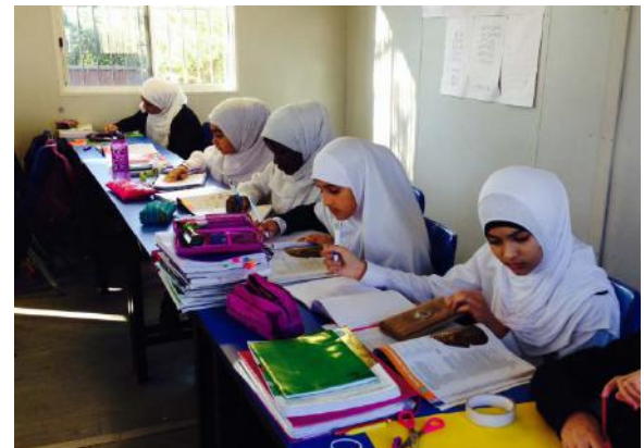
Pondering on Science