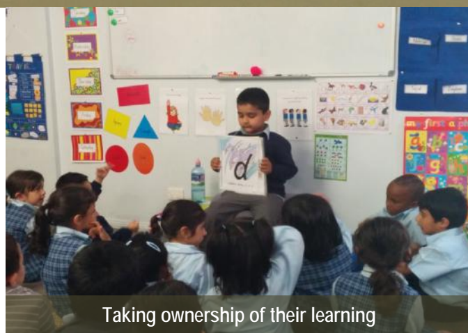
Taking ownership of their learning

HSIE is linked very closely with PDH, where students are recognising that everyone is unique and are becoming aware of ways in which people grow and change. In science, we are learning about built environments, and students are having a more physical and hands-on experience in investigating the way their homes and schools have been built to fulfil certain needs. They will also be involved in designing a new classroom and will be working in groups to create a plan for their new design. May Allah bless our wonderful group of kindergarteners in becoming knowledgeable and successful people as they grow in the future.