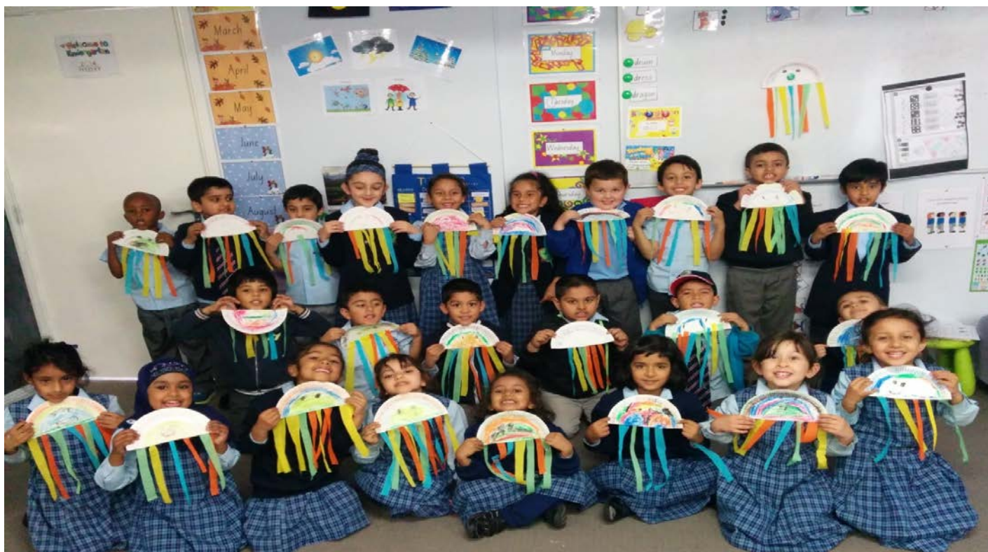
Students excited with their fantastic jellyfish artwork.

Assalaamu Alaikum, Alhamdulillah we have had a positive start to term 2. I have noticed that the kindergarten students are becoming more engaged in their studies and I feel that students have a general eagerness to dive into the day's lessons. The students have grown tremendously, showing more responsibility in the classroom environment and respecting others around them. I do hope that this growth will continue throughout the learning year. During English speaking and listening sessions, kindergarten students have been learning about sea creatures. I am so proud with the amount of effort each student in kindergarten has put in their presentations, and they are now looking forward to having a real life experience with sea creatures at the Sydney Aquarium. This has had a huge impact in building their self-esteem and confidence in speaking out in public. In HSIE, we are currently studying the unit 'This is me' where students are exploring their special characteristics and building their skill of comparing their backgrounds, culture and past experiences.