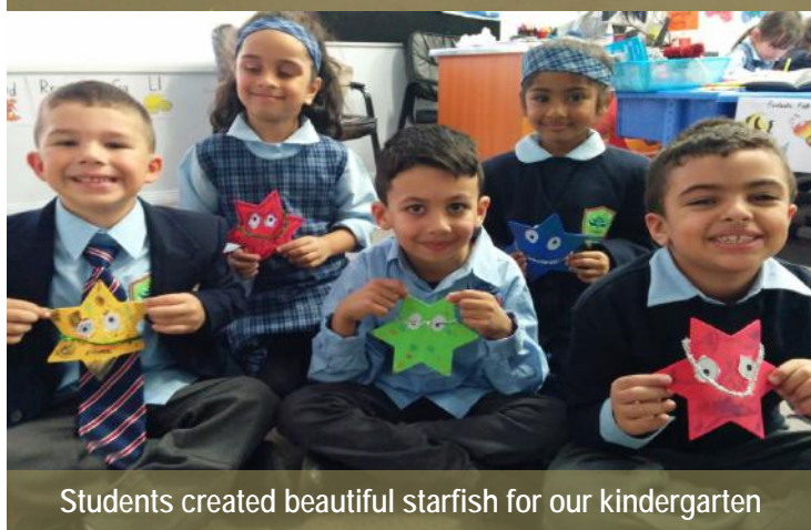
Students created beautiful starfish for our kindergarten