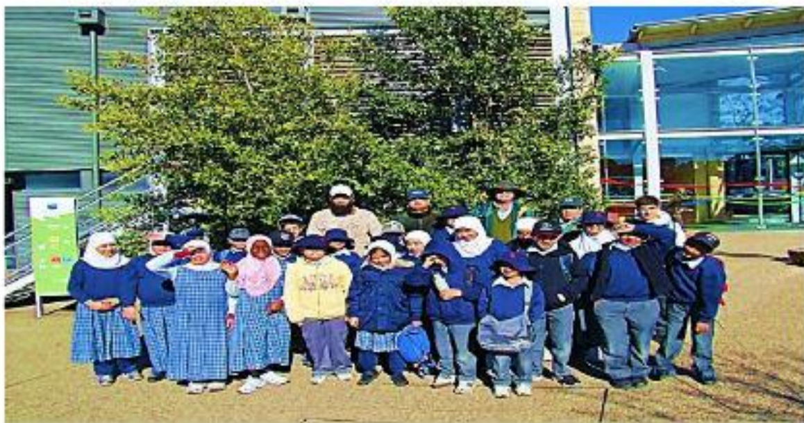
Students of Year 3-6 with their teachers at Blue Mountains excursion