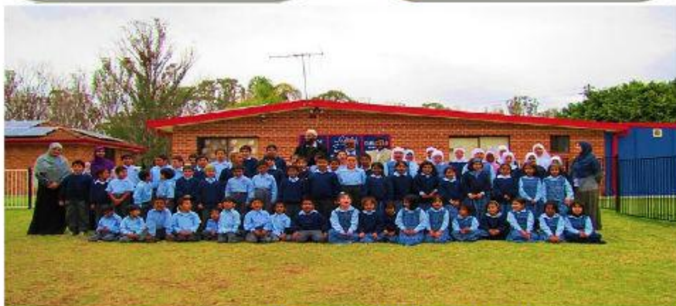
Western Grammar staff and students with the Chairman School Board

This report is a comprehensive summary of our academic and extra-curricular activities throughout last year, our financial summary & our future plans etc. We are happy to receive your feedback about the report and overall performance stated in the report.