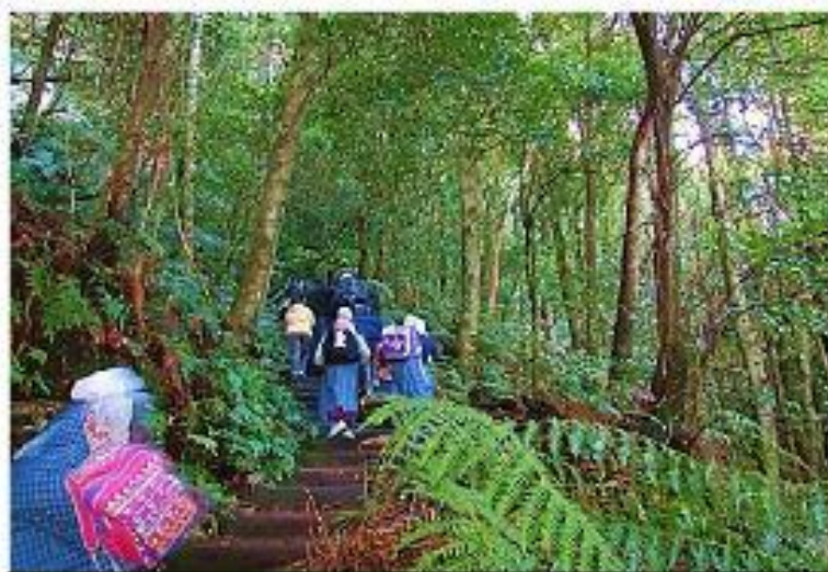
Excursion in Blue Mountains - Students are on bush walk