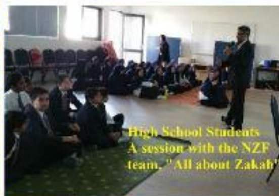
High School Students A session with the NZF team, "All about Zakah"