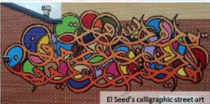
El Seed's calligraphic street art