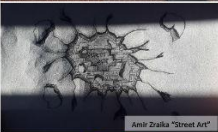
Amir Zraika "Street Art"