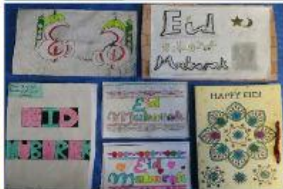
WGS Students' Eid Cards