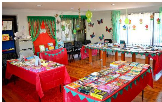
Scholastics Book Fair