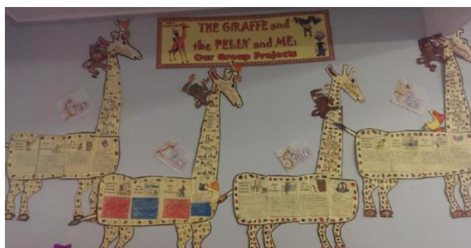
Year 3/4, Shared Reading Group Project: The Giraffe and the Pelly & Me