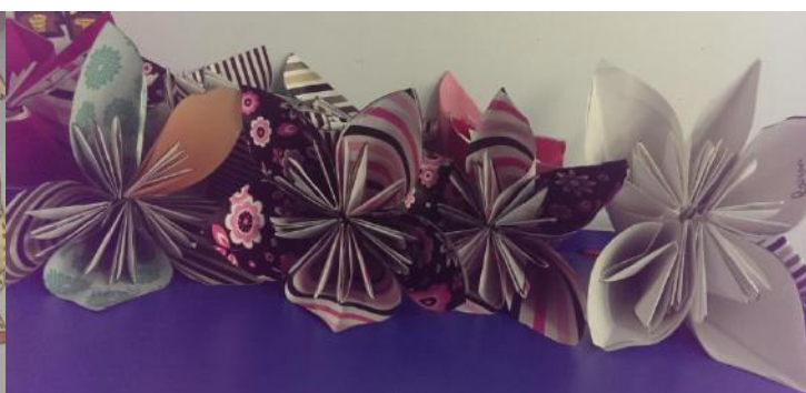
CAPA, Production of Origami Flowers