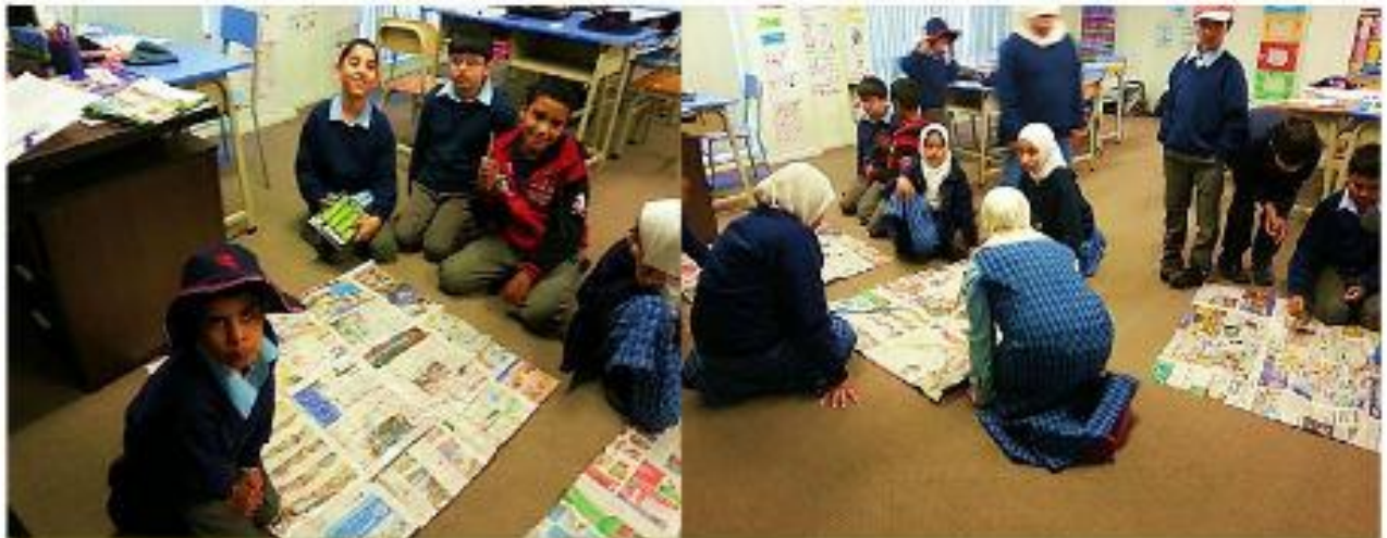
Children busy making square meter with Newspaper