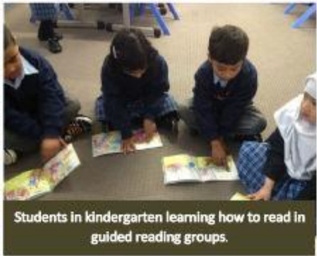
Students in kindergarten learning how to read in guided reading groups.