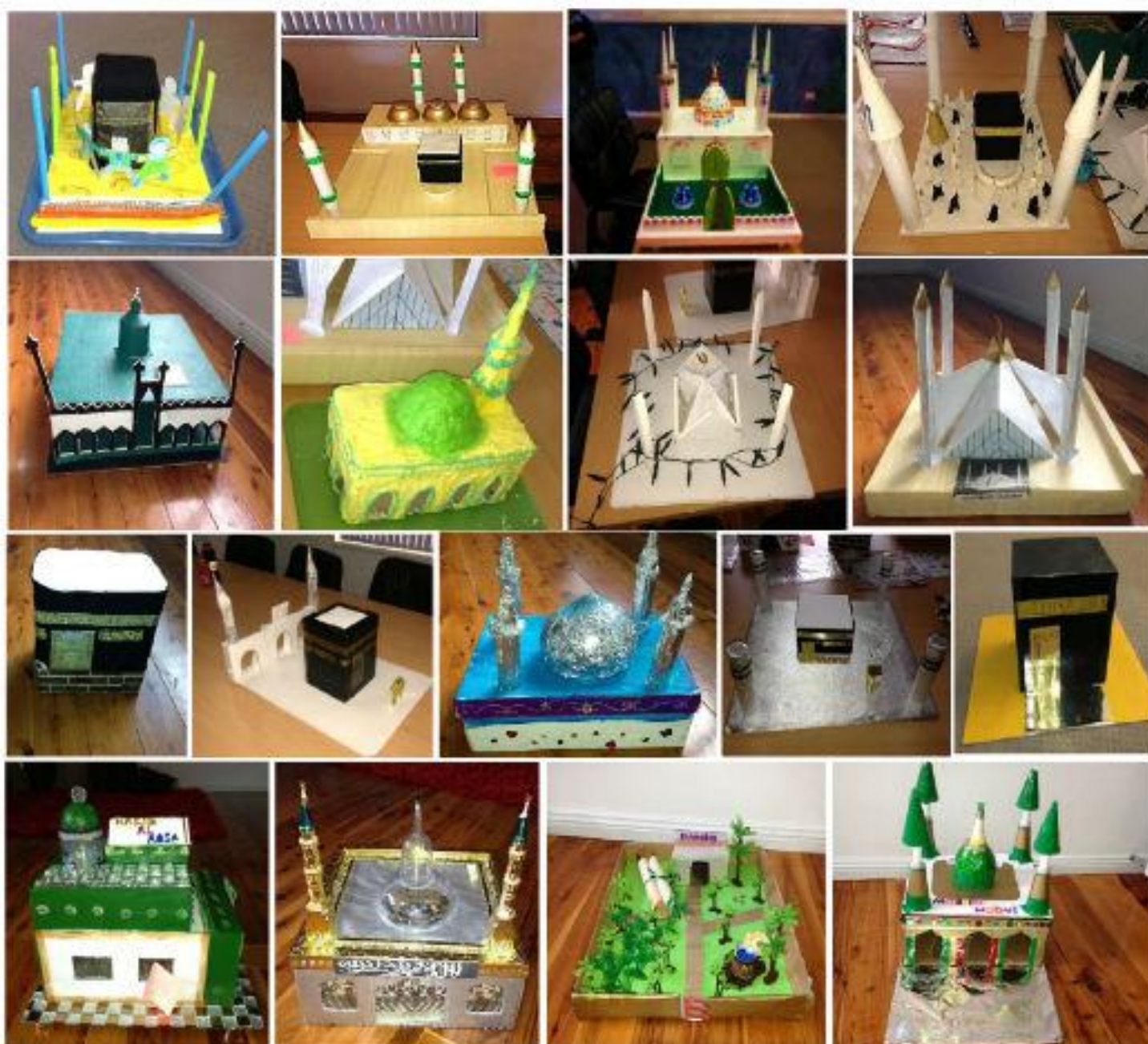
Beautiful models made by our students for Ramadan 3D Modelling Competition