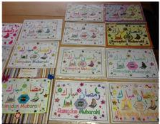
Entries from K-1 for Ramadan Colouring competition