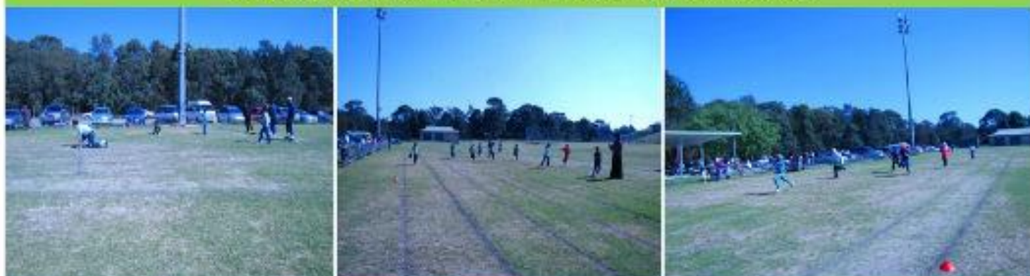
In the 50 metre, 100 metre and 400 metre relays, everyone was so delighted and parents & teachers participated too