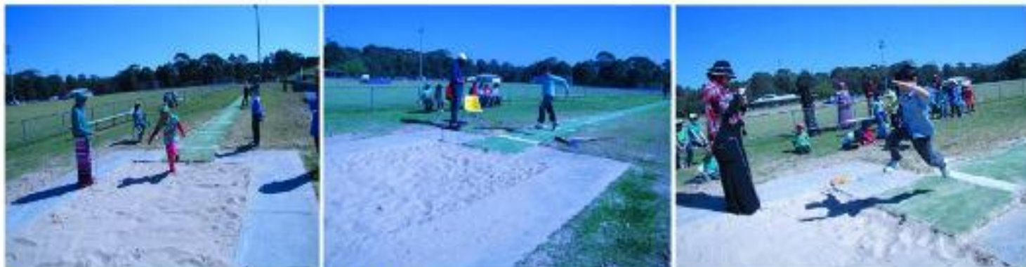
Long jump was an exciting event which students enjoyed immensely.

'Do not run!' 'Settle down!' 'Play time is over!' these are some exclamations which are all too familiar for students. But on Wednesday 5 th September, students had the opportunity to run all they wanted and exert as much energy they had without the fear of being asked to stop.