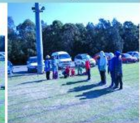
Three Legged Race