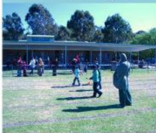
Egg & Spoon

Shot Put: It was so exciting that our Principal (in the middle) could not hold himself back from taking part in the event