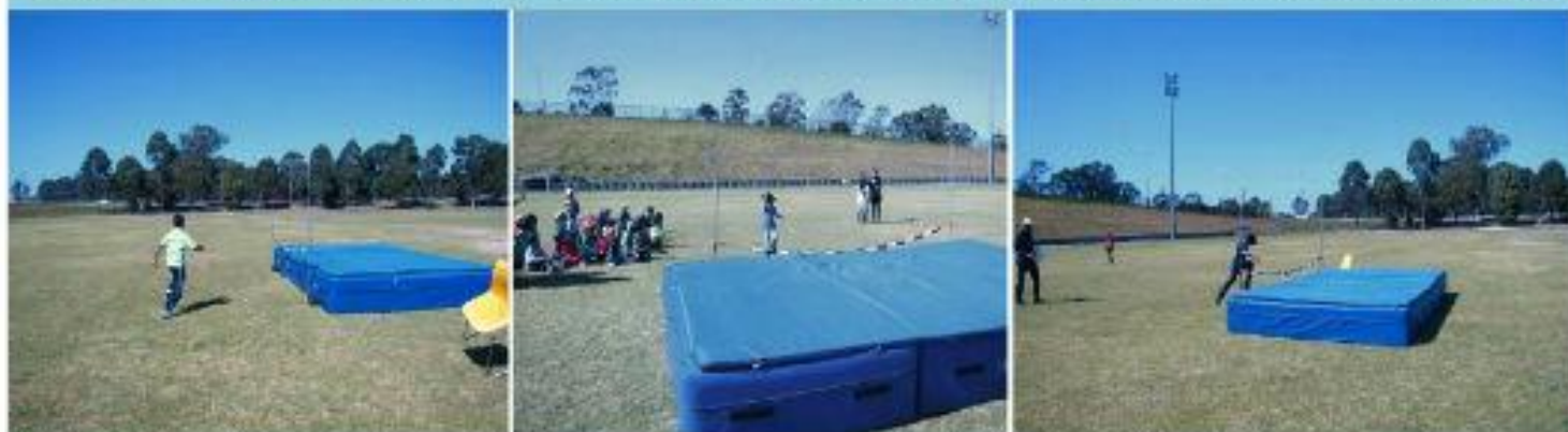
It's not the age that matters but the determination. Even Kindergarten students were jumping high.

This is because Western Grammar conducted its annual athletics carnival at Charlie Bali Reserve. Despite being a small school with limited students, we were flat-out all day conducting close to a total of 50 individual events, ranging from novelty activities such as three legged races, to track and field such as high jump and shot put.