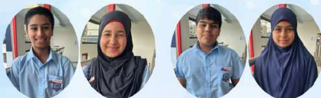
Year 6 Captains